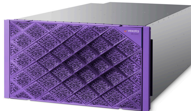
Vexata VX-100F Scalable NVMe Flash Array

Thin Provisioning Pattern Removal Space Efficient Snaps/Clones Data at Rest Encryption